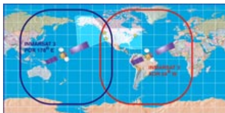
Coverage prior to AOR-W move

Upon completion of this move, sometime in April or early May 2006, WAAS will temporarily be unavailable in the extreme Northeast U.S. No impact is expected for the remainder of the U.S. Service will be fully restored in the fall of 2006 when the FAA's new WAAS geostationary satellite (PanAmSat) is fully operational.